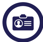
Access control and administrative privilege management